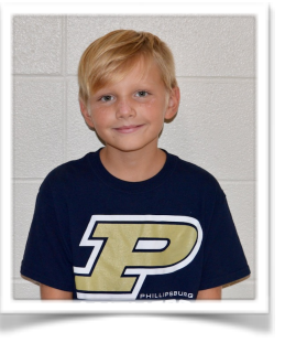
"It's a bigger school."