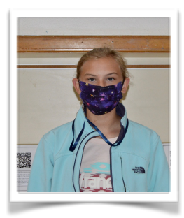
"I don't like them."