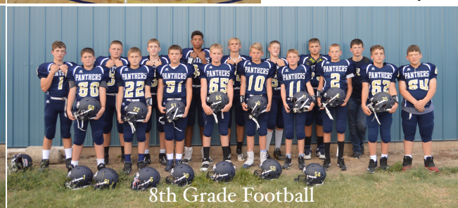
8th Grade Football