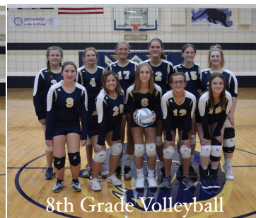
8th Grade Volleyball