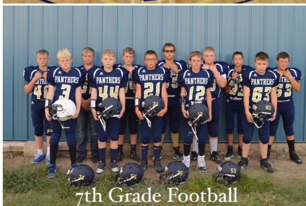
7th Grade Football