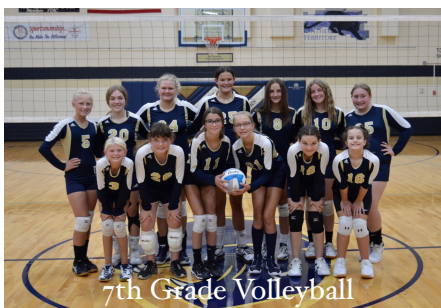
7th Grade Volleyball

Last Friday our fall athletes had a great, but very hot, start to their season. They had team pictures taken, scrimmaged each other, got recognized at the football field, and enjoyed a free meal. This week they had their first matches, races, and games, so we'll bring you those articles and pictures next week. Go Panthers!!